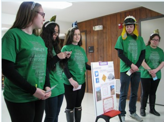
Belvidere High School Oral Presentation

The Envirothon experience provides students with the ability to think critically and enhance their problem solving skills. It gives students the opportunity to be role models in their community. Lastly, it prepares student for future careers in natural resource areas.